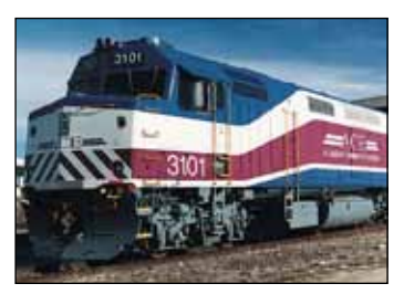
Altamont Commuter Express (ACE) train

In November 2008, Santa Clara County voters reaffirmed their strong commitment to bringing BART to Silicon Valley by passing Measure B, a 1/8th cent sales tax to cover operating expenses. Passage of this tax signaled the public's strong support for BART, despite the economic downturn, and the need to prioritize this project high in VTA's capital program. This dedicated source of funding should enhance the project's competitiveness for federal funding in the New Starts Program. Collection of the tax is contingent on VTA receiving a commitment of $750 million from the federal government to support construction of the extension.