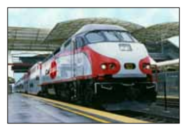
Caltrain Baby Bullet