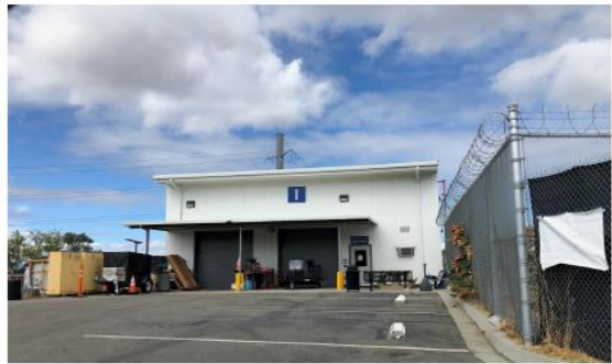
Remove and Relocate or Replace?

Remove and relocate to paratransit area. VTA has provided an updated Phase 1 plan to firms eligible to respond to the RFP. Location for this building has been marked as "A." * Alternatively, additional square footage could be added to the administrative building to accommodate.