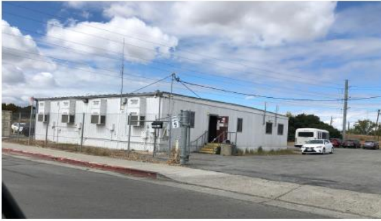
Remove and Relocate or Replace?

Remove and relocate to paratransit area. VTA has provided an updated Phase 1 plan to firms eligible to respond to the RFP. Location for this building has been marked as "A." * Alternatively, additional square footage could be added to the administrative building to accommodate.