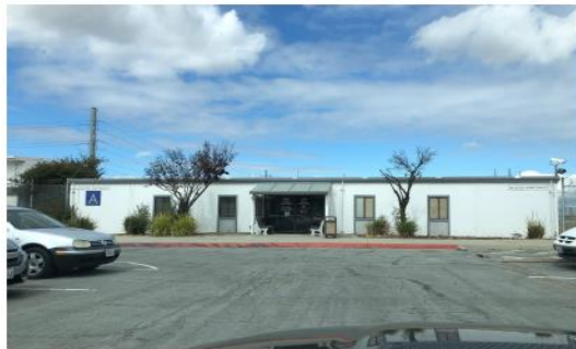
Remove and Relocate or Replace?

Remove and relocate. VTA has provided an updated Phase 1 plan to firms eligible to respond to the RFP. Location for this building has been marked as "B." *